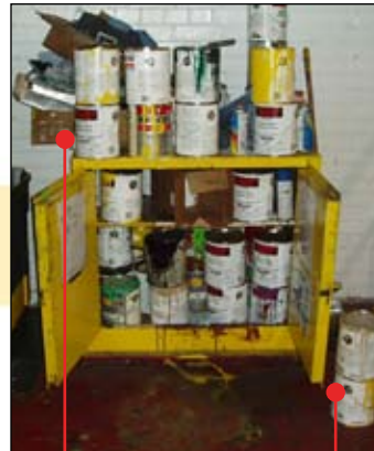
Violation: Flammable items stored outside a cabinet