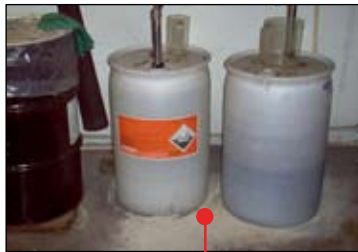
Violation: No ground spill protection

May need compliant spill pallets May need compliant spill pallets May need approved drum lids