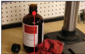
Violation: Open containers are not approved and allow VOC's into the air

Replace with approved "Safety Cans" Approved safety cans, plunger cans or bench-top solvent cans