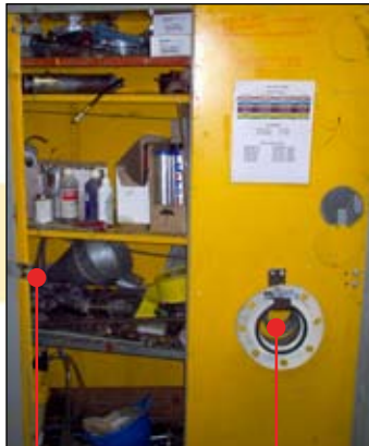
Violation: Padlock hasps or brackets screwed to cabinet