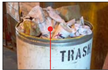
Violation: Fluid soaked wipes in open trash cans