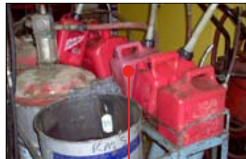
Violation: Not approved "Safety Cans"