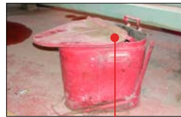
Violation: Inoperable oily waste cans