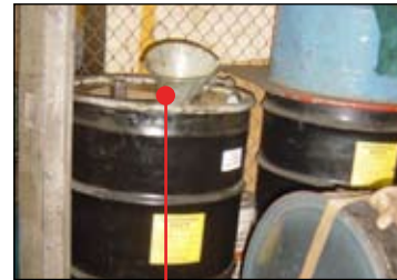
Violation: Not compliant safety funnel or drum lid