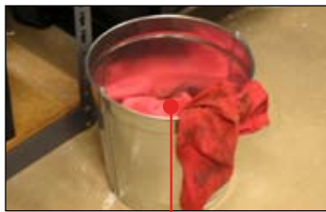
Violation: Fluid soaked rags are a fire hazard

Provide approved oily waste cans Provide approved oily waste cans Replace with new oily waste can