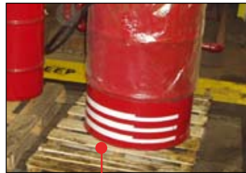
Violation: Not compliant spill pallet